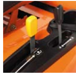
Hydraulic mower lift lever