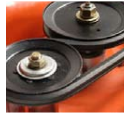
Ultra-durable, long-life hexagonal belt