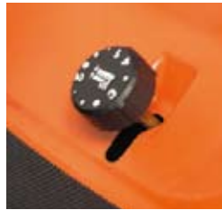
Easy reach cutting height adjustment dial

Note: The above photo is shown with respect to French regulation.