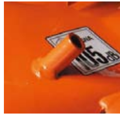
Deck cleaning pipe for connecting water hose